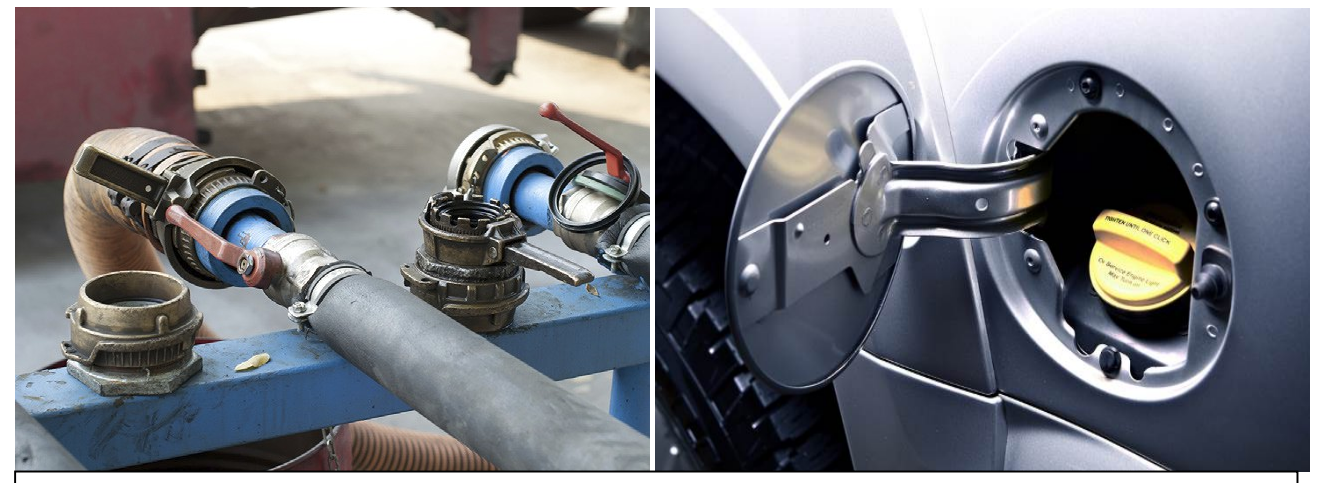
Easy to blend VpCI®- 705 Bio will provide powerful corrosion protection to upper cylinder walls, piston heads and rings during operation or shutdown.

VpCI®-705 Bio - Powered by Nano VpCI®- is a new specially formulated, biobased, biodegradable, multifunctional fuel additive to bio-fuels, produced using renewable and sustainable raw materials. This environmentally friendly product serves as a corrosion inhibitor, fuel stabilizer and water emulsifier for biodiesel, diesel, gasoline, gasohol mixtures and other biofuels. It provides premium multiphase corrosion protection, lubricity and elastomer protection allowing better engine performance.