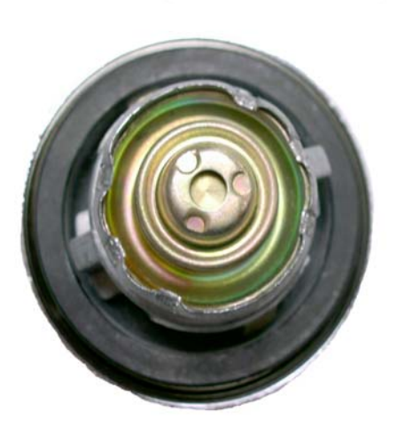
Fuel treated with VpCI ®-705 Bio

In industry there is often a requirement for large fuel storage tanks and systems. This can cause problems such as fuel separation and potentially freezing in cold climates. Cortec<sup>®</sup>'s VpCI<sup>®</sup>-705 Bio helps alleviate this problem by reducing fuel freezing point. It provides stability and reduces the build-up of static charges that cause explosions.