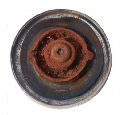
Without VpCI®-705 Bio

This additive does not contain trace metals, chlorides, chromates, nitrites or phosphates and does not form corrosive combustible products. It absorbs water in tank and fuel line and can be fogged into fuel tanks.