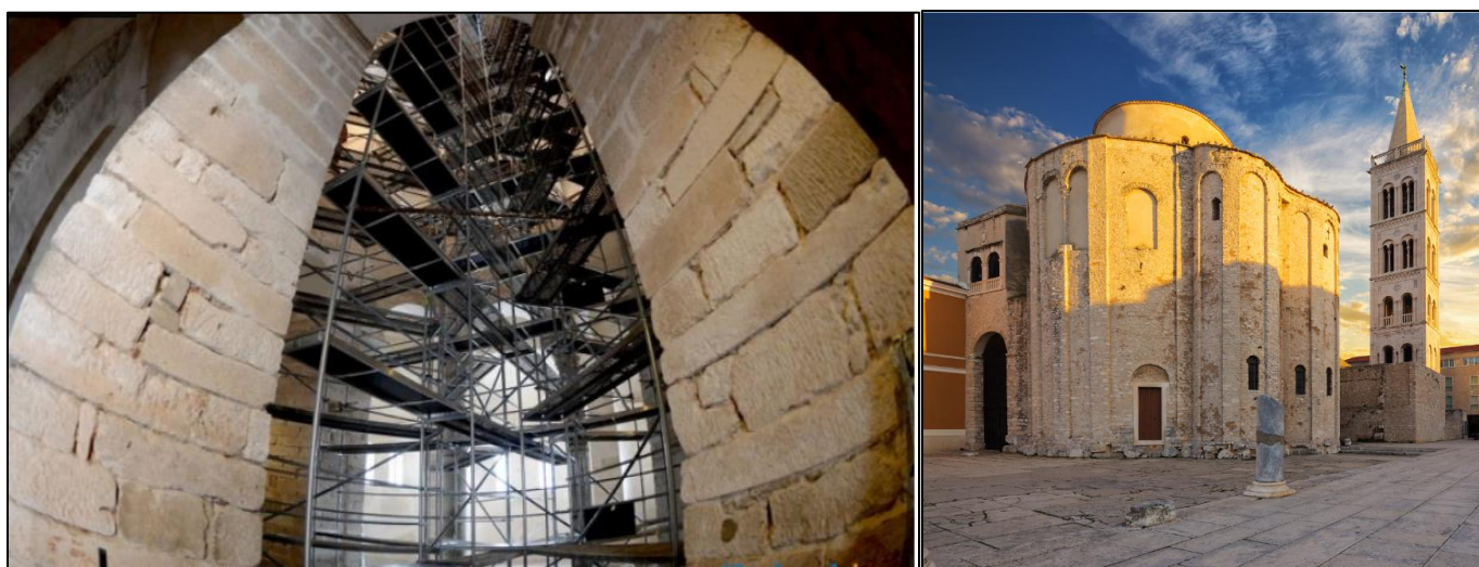
The moisture penetrating into the medieval monument, in combination with the sea dust, very seriously endangers the reinforced-concrete structure, which holds the church of St. Donat.

Last year a repair project was initiated and Cortec's MCI® 2020 inhibitor was specified as coating to protect support structure against corrosion. MCI® 2020 is a surface applied corrosion inhibitor designed to migrate through even the densest concrete structures and seek out the steel reinforcement bars in concrete. Even when not in direct contact with metal, the product will migrate through concrete to provide full protection. This environmentally safe inhibitor stops further corrosion of reinforcing metals, significantly extending the service life of the structure.