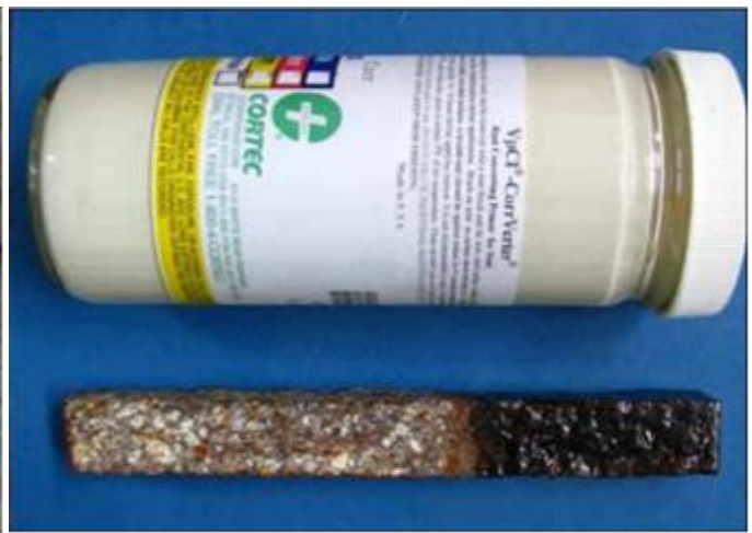
Left picture: Damaged steel bands. Right picture: CorrVerter® applied to the right side of the band; the coating has converted the corrosion into a protective layer.

Need a High-Resolution Photo? Please Visit: www.cortecadvertising.com