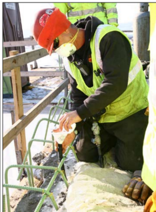
A construction worker applying MCI®-309 Powder for Post Tensioning (PT) Cables to the Wacouta Bridge in South St. Paul, Minnesota.