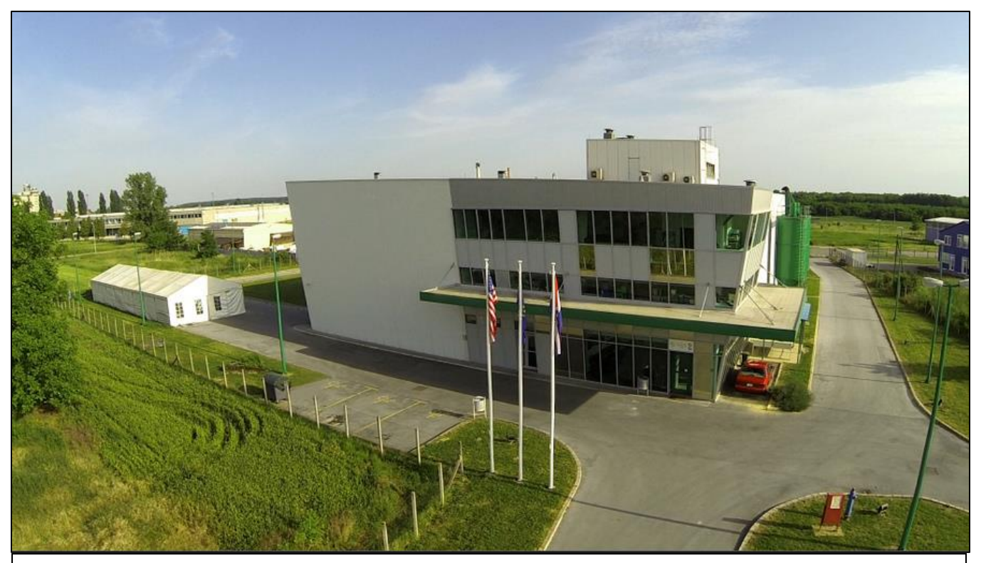
Greed fields around the plant where recycling center and composting areas are located, circle EcoCortec's philosophy of utilizing new technologies while preserving the environment.

noted: "That acknowledgement of Best Supplier Award I see as an appreciation of our great partnership, and that partnership truly reflects on our own customer relations every day."