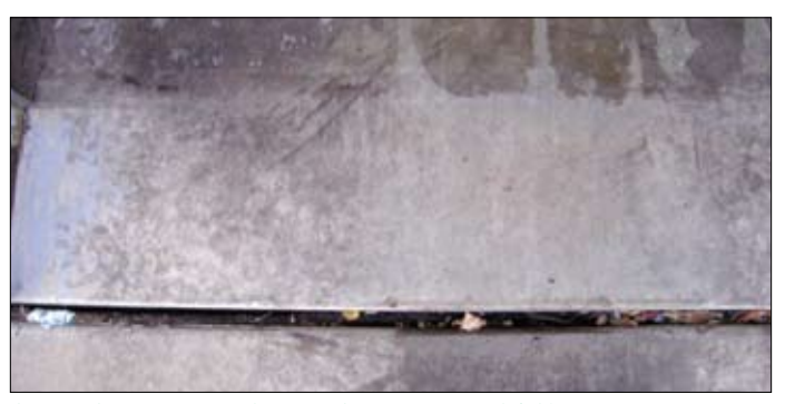
Garage floor doorway 12 hours after cleaning; MCI®-2061 was applied to the right side