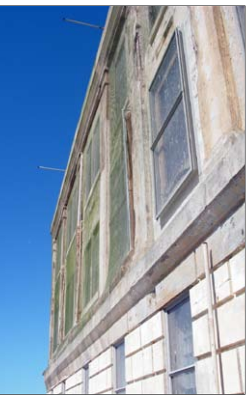
Close-up of corrosion damage