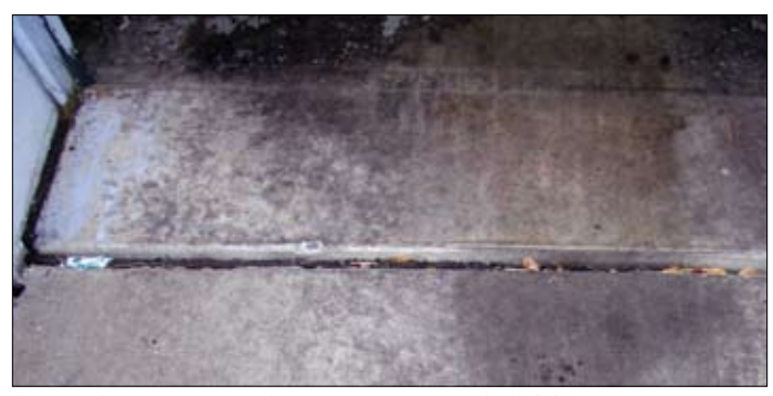
Garage floor doorway before the application of MCI®-2061.

MCI®-2061 is a powerful cleaner that safely and effectively cleans oil stains on concrete. This hard surface cleaner is unique because it combines powerful cleaning chemistry with microorganisms capable of biodegrading hydrocarbons, such as those found in oil, diesel, and other materials that stain concrete. MCI®- 2061 is an environmentally friendly alternative that eliminates the need for harsh solvent-based and alkaline cleaners.