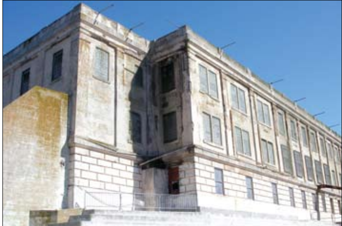
Main Prison Building

Alcatraz Island is a small island located in the middle of the bay in San Francisco, California. It is the site of the infamous Alcatraz federal penitentiary; the fist lighthouse and the first United States Military Fortification on the West Coast. Being surrounded by salt water and fog year round causes numerous corrosion issues for the current stewards of Alcatraz, The National Park Service (NPS). When the NPS noticed a potential hazard of loose concrete on the walls high above the open visitor area on the main prison building, they contacted Cortec® distributor, Integrated Packaging Solutions of San Jose, California, for solutions. Since funding was minimal and patching the areas is slated for a future project, the NPS chose to remove the hazardous concrete and apply MCI®-2020, which penetrated beneath the remaining concrete surface to slow the corrosion. The exposed rebar was then coated with CorrVerter® to chemically alter the iron oxide into magnetite; thus converting the rust and slowing further corrosion. This procedure also allowed treatment to a larger area with the available funds.