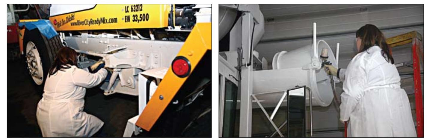
Bottom left and right: Angel Green conducting Creteskin application to a mixing truck.