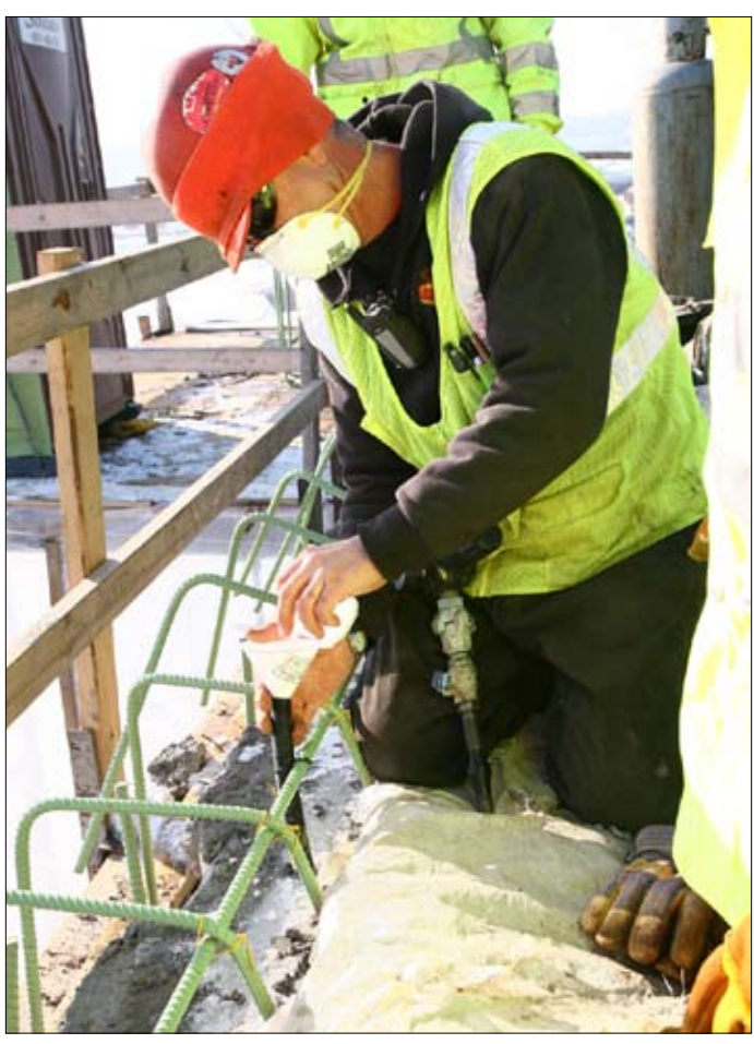
A construction worker applying MCI®-309 Powder for Post Tensoining (PT) Cables to the Wacouta Bridge in South St. Paul, Minnesota.