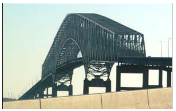
Francis Scott Key Bridge

Cortec<sup>®</sup> has furthered its green initiatives by joining the U.S. Green Building Council (USGBC) and becoming more involved in the LEED<sup>®</sup> Green Building Rating System. The USGBC is a 501(c)(3) non profit that developed the LEED (Leadership in Energy and Environmental Design) Green Building Rating System. Several of Cortec's MCI<sup>®</sup> products can help projects to achieve LEED certification. Our sales and marketing departments have partnered in order to produce a new brochure directed towards MCI<sup>®</sup> and LEED. http://www.usgbc.org/