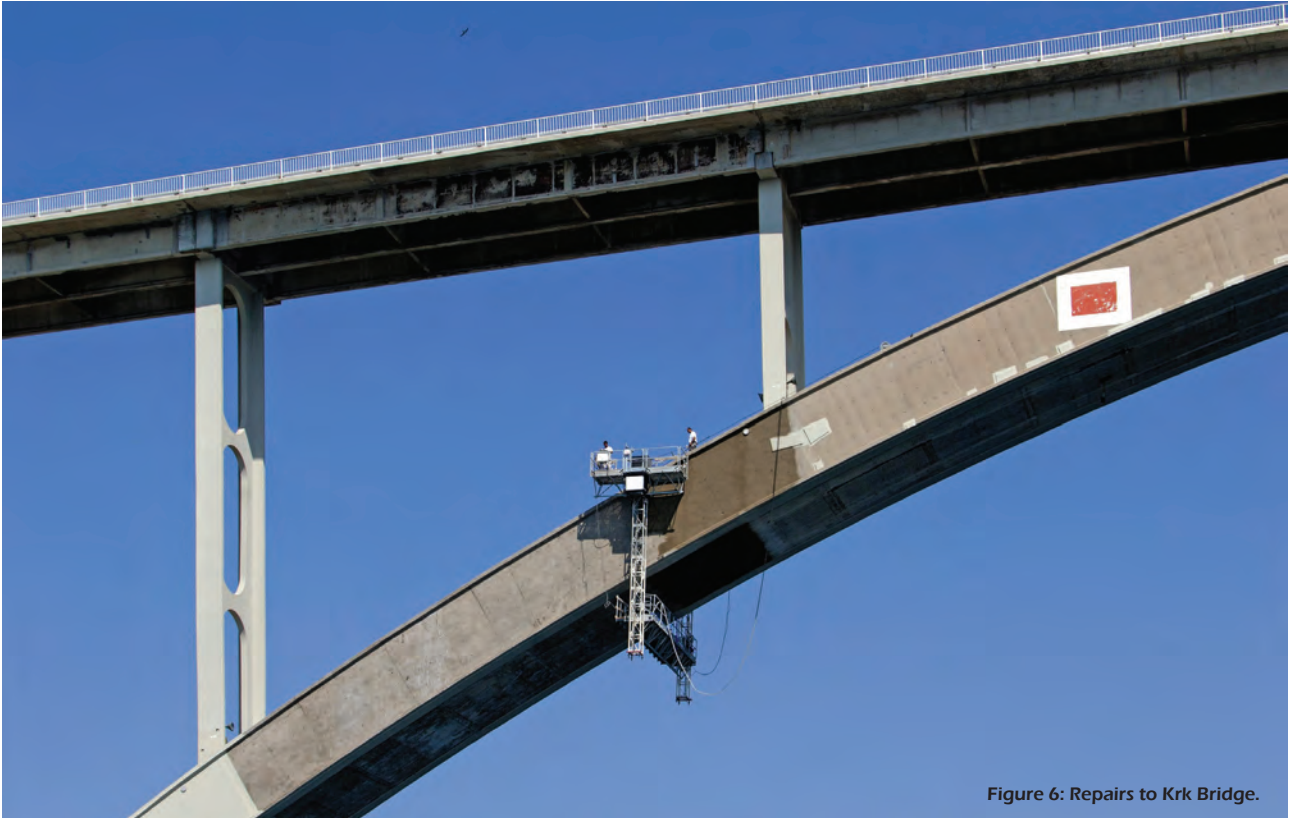
Figure 6: Repairs to Krk Bridge.

To provide additional corrosion protection to the PT cable wires during the initial period of moisture reduction – when corrosion rates could increase as oxygen became more available – and to provide a back-up if the dehumidification system went out of service (ie, for maintenance), an organic corrosion inhibitor system was developed for introduction into the dry-air stream. Concerns over fogged MCI powders blocking air voids in the cables, water-based systems being unsuitable when looking for moisture reduction to reduce the corrosion rate and solvent-based systems being incompatible with the cable wrap and RH probes, meant a different approach had to be used in the development of the MCI. For these reasons, a powder-version, contained in a vapour-permeable pouch, was developed to introduce pure inhibitor vapour into the system using the