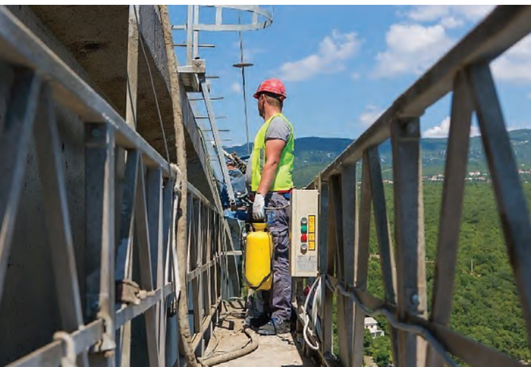
Figure 7: Below – Application of MCI to the bridge. Figure 8: Left – Repairs to Krk Bridge.

dehumidification air stream as the carrier. This ensured a sufficient level of inhibitor would be present within the air voids to protect exposed metal surfaces, while avoiding the risks of blockage by solid or liquid material. As the protective inhibitor layer is at a molecular level, it has no influence on clearances and only a minimal effect on other physical properties. Testing showed that use of the inhibitor caused a small increase in wire-to-wire friction at low contact pressure and no significant frictional effect at higher loads. Further testing was carried out to confirm the inhibitor would not adversely affect other components in the system, including cable wraps, sealants and probes. ■