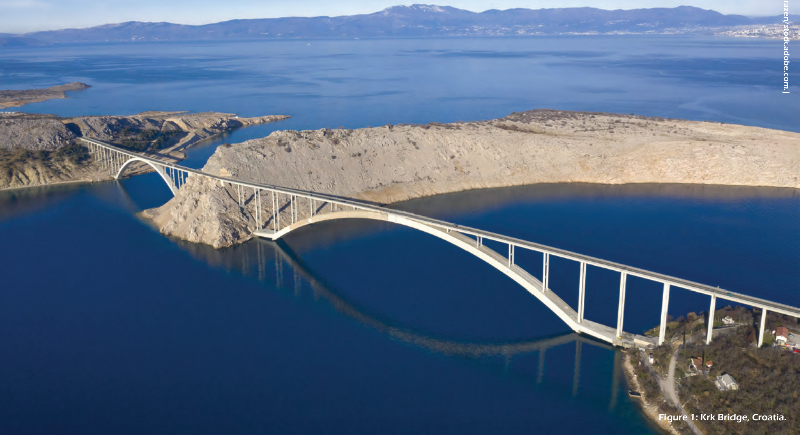
Figure 1: Krk Bridge, Croatia.