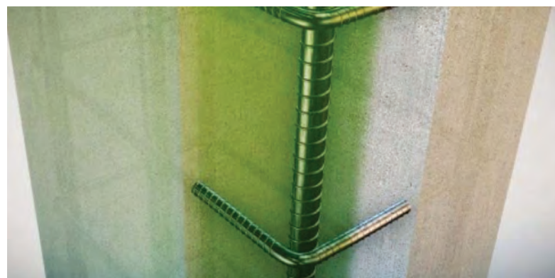
Below: Figure 5, Properties of migrating organic corrosion inhibitors.

The Severn Bridge is a 988m-span suspension bridge that carries the M48 motorway over the Severn River between Bristol and south Wales. It was built in 1966 and featured a few unique innovations, such as inclined hangars and the use of streamlined box girder deck construction. Inspections completed in 2006–2007 found that the PT cables were corroded and had reduced structural strength. Following this investigation, an acoustic monitoring system and dry air injection system were installed on both main suspension cables to control the deterioration. The purpose of the dry-air injection system was to reduce the relative humidity (RH) within the cables to <40% – an accepted percentage to prevent corrosion of metals.